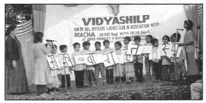
Welcome song on Annual Day Celebrations – 17th February, 2005.

are free of cost, and the expenses met through financial and material contributions from BOC, BOLC and individual donations. This year the children were taken for a visit to the Zoo. A cultural programme was presented by them as part of Annual Day celebrations. A few children will appear for primary class exams from National open schools.