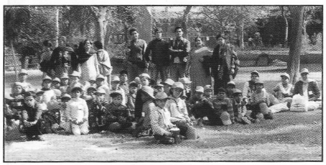
Visit to the Zoo - January 2005.

All amenities being provided to the children