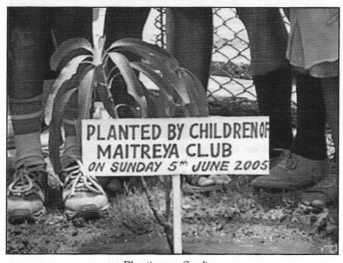
Planting a Sapling.